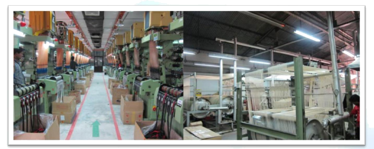
Narrow fabric weaving, knitting & dyeing