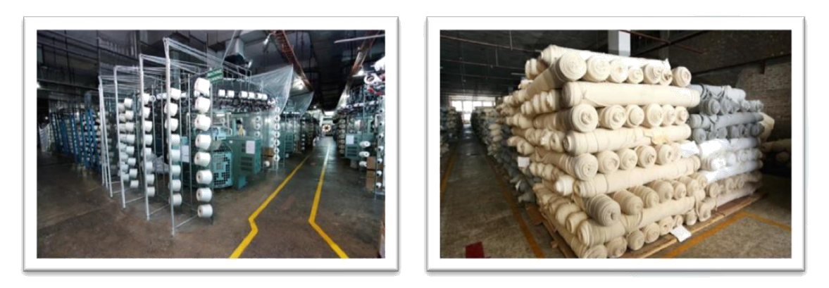
Sections of circular knitting department

Warp knit: Fourteen warp knitting machines including yarn and elastane beam warping machines were purchased from Karl Mayer Germany to set up the facilities. Tricot , Raschel and Simplex fabrics, in many varieties, are supplied for lingerie, swimwear and active wear production. Our total warp knit capacity stands at 250,000 meters per month with individual capacities listed below: