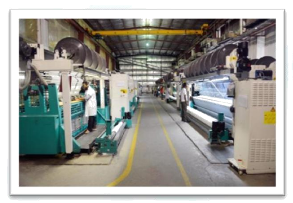
Elastane warping and warp knitting sections

Flat knit: To ensure utmost quality nine Shima Seki flat knit machines were set up to produce fabrics for collars, cuffs and styling. The flat knit fabrics can be solid dyed or yarn dyed with a total Capacity of 6,000 sets / day